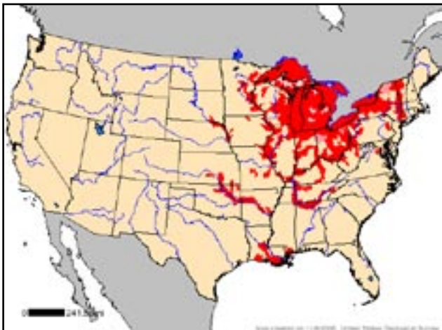
Zebra mussels are not known to occur in Montana, but have a high potential of being introduced and establishing in Montana waterways.