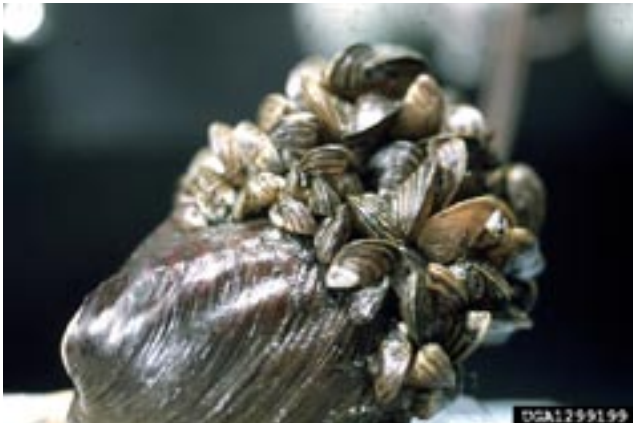
Zebra mussels can cause mortality in native clams and mussels.