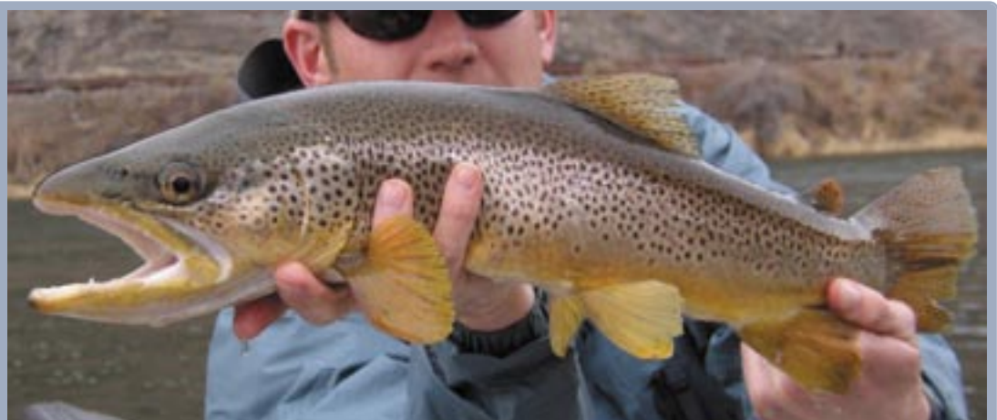
Missouri River Brown - Anonymous View Fish-Pic archives at www.patbarnestu.org